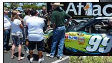
Above: The Aflac #99 NASCAR was a big hit