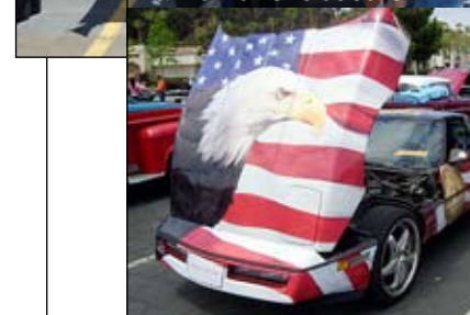
Above: Corpsman's Pick (to no one's surprise)