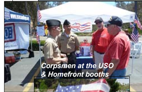
Corpsmen at the USO & Homefront booths