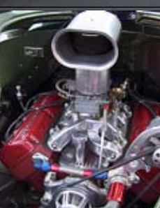
Right: the early Hemi in the Willys coupe