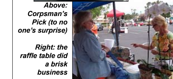
Right: the raffle table did a brisk business