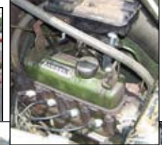
Best Foreign (ain't its engine, above, cute?)