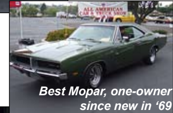
Best Mopar, one-owner since new in '69