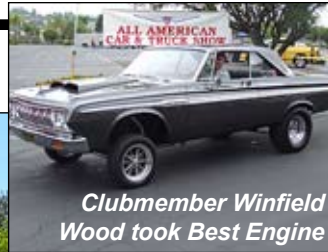
Clubmember Winfield Wood took Best Engine