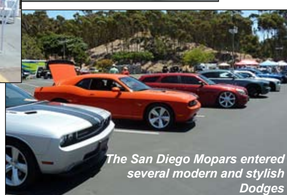
The San Diego Mopars entered several modern and stylish Dodges