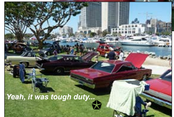
Yeah, it was tough duty...