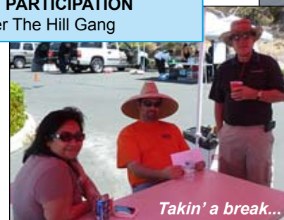
Takin' a break...