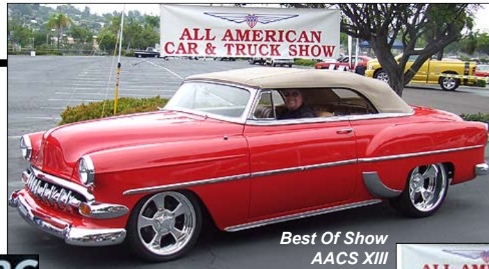
Best Of Show AACS XIII